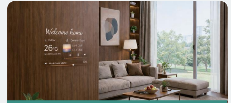
智能家居 Smart home