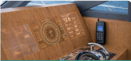
豪華游艇 Luxury yacht