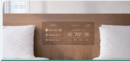
高檔酒店 High-end hotel